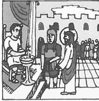
1. Jesus is condemned to death