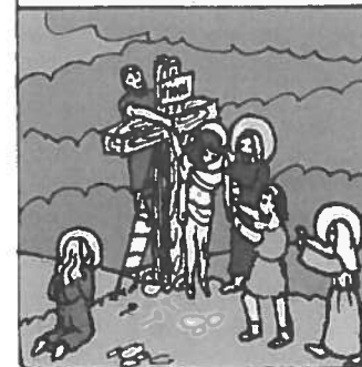
13. Jesus is taken down from the cross