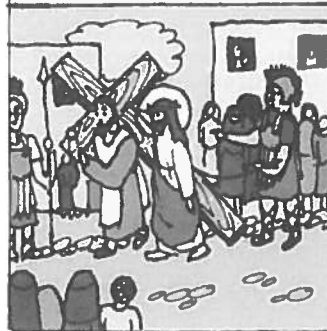
5. Simon helps Jesus carry the cross