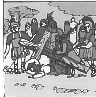
9. Jesus falls the third time