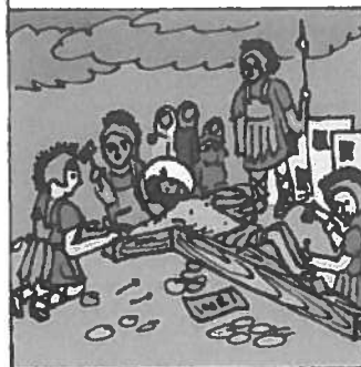
11. Jesus is nailed to the cross