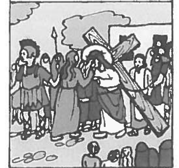
6. Veronica wipes the face of Jesus