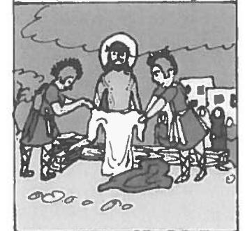
10. Jesus is stripped of His clothing