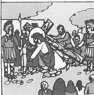
7. Jesus falls the second time