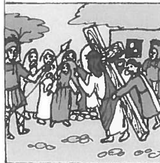
8. Jesus speaks to the women of Jerusalem