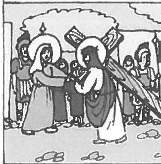
4. Jesus meets His mother