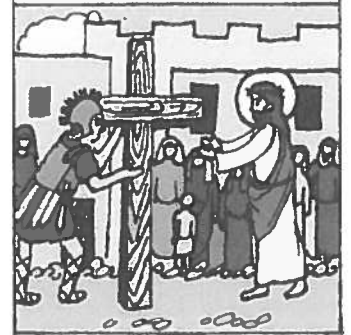
2. Jesus takes up His cross