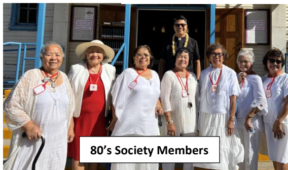
80's Society Members