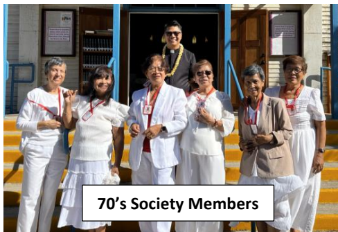
70's Society Members