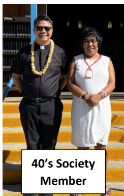
40's Society Member