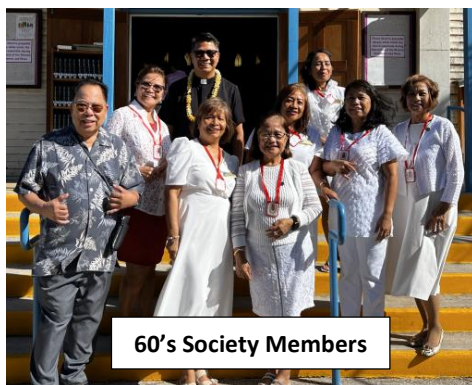
60's Society Members