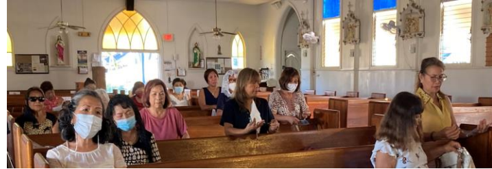
Mahalo to all who came to honor St. Michael on his feast day. We thank him for his continued protection.