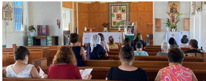
Pictured below are some of the ladies who joined in the Feast Day. Here they stop for a picture after their celebration outside of the Hall.